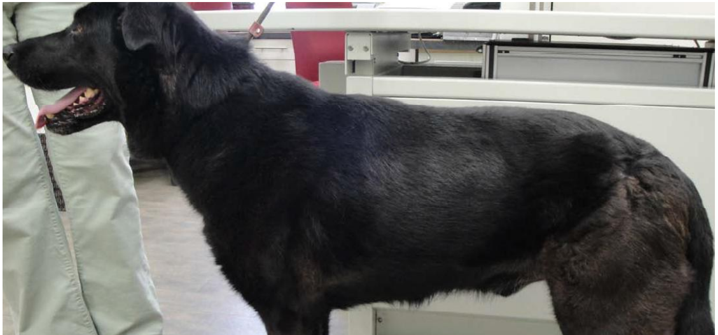
Figure 6 - Day 132 (final assessment).

the patient was feeling good and moving normally on long walks. Treatment with the G, H, I protocol was continued at one week intervals.