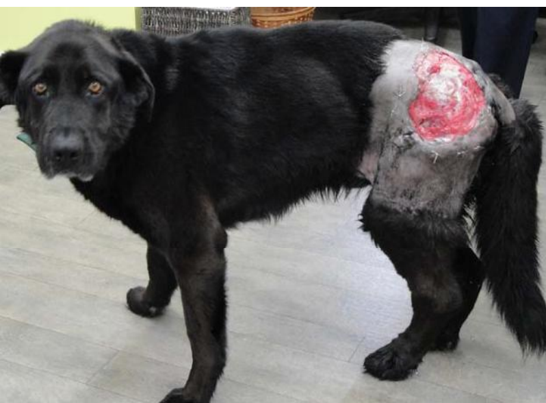
Figure 2 - Day 0 (first day) of FSLLL therapy.

Day - 1: The entire left hind leg from upper thigh through to the digits was swollen with pitting edema and a portion of the skin edge was necrotic. The tissue surrounding the wound was hot to the touch. The patient was eating little and developed epistaxis with constant dripping of blood-tinged fluid from his nostrils. The bleeding was perhaps an anti-platelet adverse reaction to the potentiated sulfonamide antibiotic. His body temperature was 39.3°C.