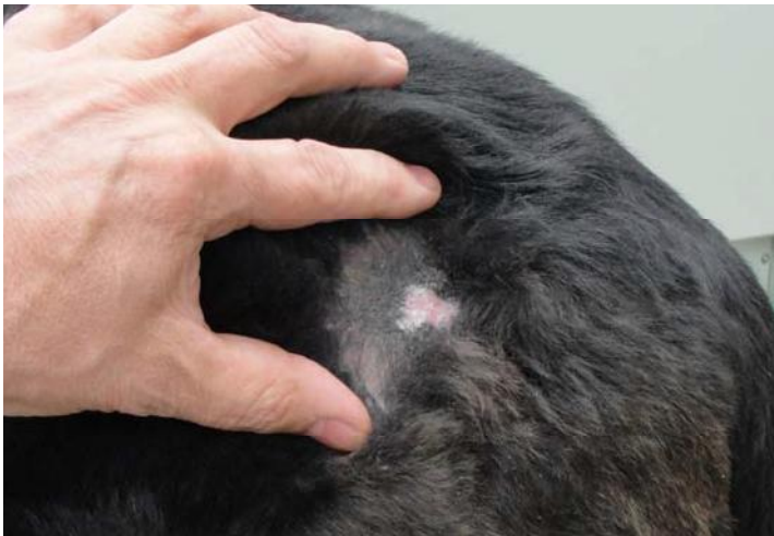
Figure 5 - Day 132 (final assessment).