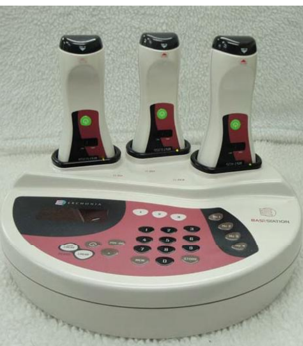
Figure 1 - Erchonia base station.

The methodology followed in this case report was developed by Dr. William Inman of VOM Seminars Incorporated. The frequencies originally arose from Rife frequencies developed in the 20th century. Inman utilized these