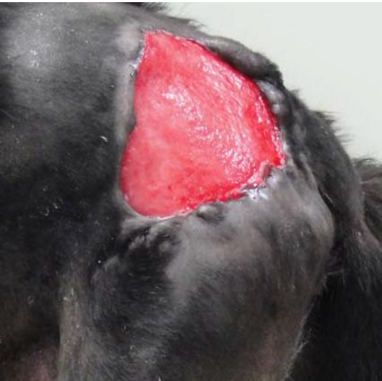
Figure 3 -Day 29 of FSLLL therapy.

Day - 20: The underlying muscle tissue was very clean and erythematous, likely due to improved circulation. Since the infection appeared to be resolved, the infection frequencies were discontinued and replaced with frequencies for general pain and inflammation. The new protocol (G, H, and I) was continued twice weekly until day 48.