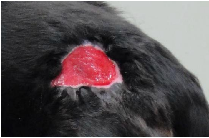
Figure 4 - Day 62 of FSLLL therapy.