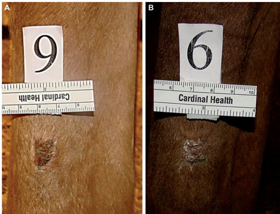
Figure 4 Appearance of (A) control and (B) laser-treated wounds at day 80.

[10]. A significant clinical observation was the absence of exuberant granulation tissue in the laser-treated wounds. The wound margins of the laser-treated wounds contracted and epithelialized and the overall contour of the wounds