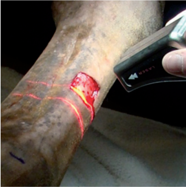
Figure 2 LLLT of metacarpal wound using a dual-diode, line generated optical scanner (model EML; Erchonia Laser Healthcare, McKinney, TX, USA).

These energy parameters were established according to the manufacturer's specifications. Total energy delivered to the wound was 5.1 J/cm 2 per treatment.