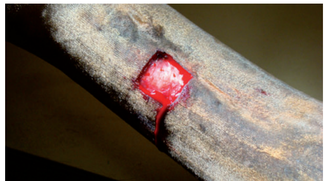
Figure 1 2.5×2.5 cm 2 full-thickness skin wound.

A randomized experimental design was used so that an equal number of right and left legs were used for both control and experimental data points. LLLT was applied to the experimental wounds every other day for 80 days. The laser beam target area was determined by manually maintaining the optical scanner approximately 3 cm from the wound area and irradiating a 4 cm 2 area (linear beam size) directly over the wound site (Figure 2). LLLT was administered using a line generated optical scanner with a dual diode laser system (model EML; Erchonia Laser Healthcare, McKinney, TX, USA) at a wavelength of 635 nm and an energy output of 17 mW per diode. Laser therapy was initiated and applied at the wound site for 5 min with pre-set pulsed laser therapy frequencies alternating from 28, 16, 12, to 4 Hz, with a 50% duty cycle from each diode, i.e., as the laser is a dual diode system one diode will pulse 28 and 16 Hz rotating frequencies every second and the other diode would pulse at 12 and 4 Hz.