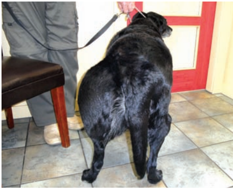
Figure 1. Case Report 3 at the start of FSLLT

The patient, an 11-year-old neutered, female Labrador retriever, was presented to the hospital with a massively swollen left hind leg. The leg had become markedly enlarged over the previous 24 hours. Radiographs revealed mild arthritis in the stifle but no evidence of a bone tumor. An infection and a soft-tissue tumor were considered the most likely differential diagnoses. The dog was started on marbofloxacin (h) (1.45 mg/kg PO q 24 h) and an aspirate was taken of the enlarged leg.