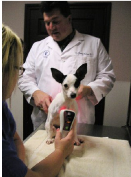
Isn't she cute...?

"Laser light then communicates to the cells on a very basic and powerful level. The nature of the laser light has several facets: