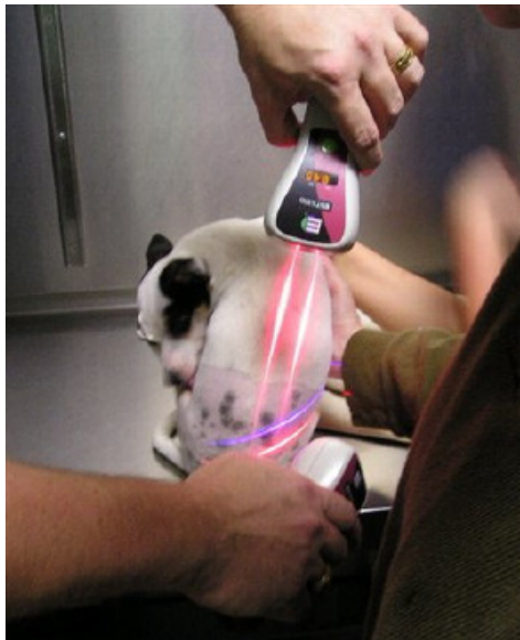
The lasers are on another surgery site--there are lots of stitches on the outside of this hip and leg.

The different modes of use-- (it seemed to me like a combination of these were being used on Baby):