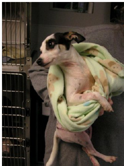
Baby is just a ham. She is giving a last look at the friendly Rottweiler in the cage under hers--and a last growl. She was the littlest princess of the clinic.

Baby needs hot and cold packs to reduce swelling--one knee and one hip were particularly swollen. She also need three medications several times each day for pain control and antibiotics.