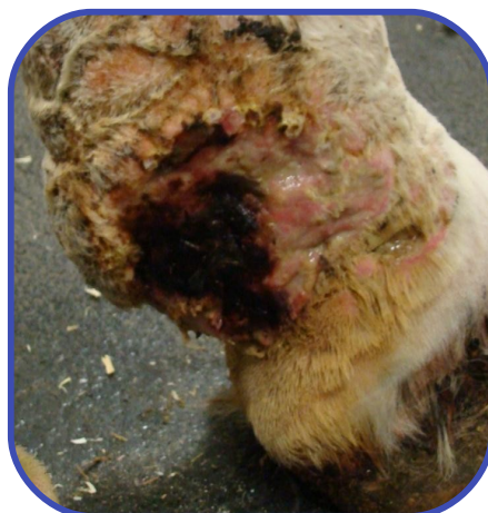
Fig 4. Left hindlimb post-operatively.

performed. The LLLT device was a 7.5 milli Watt dual diode, 635 nm, constant wave 3b medical laser a (Fig. 6). All ANSI laser safety guidelines for use of lasers on health care facilities (Z136.3) were closely observed. LLLT consisted of 5 minutes over the wounds, 3 minutes over the distal limb and 3 minutes over the nerve root (L3) (Fig. 7). Epithelialization and contraction were documented photographically daily (Fig 8 and 9).