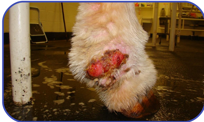
Fig 8. Left hindlimb leg wound on March 9, 2011 (91 days post-op).