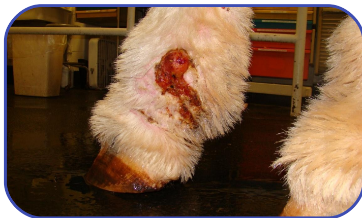
Fig 9. Right hindlimb wound on March 9, 2011 (91 days post-op).